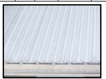
Extrude corrugated knurled floor