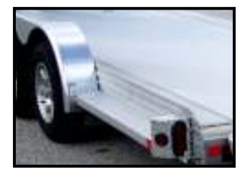
Running boards front and rear