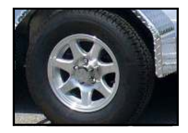
Optional Aluminum spoke wheels