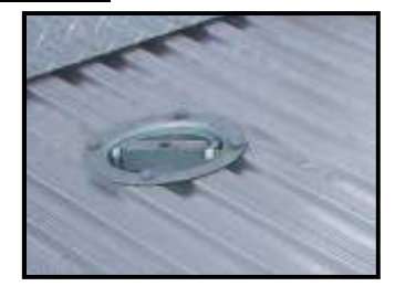
Recessed swivel D ring