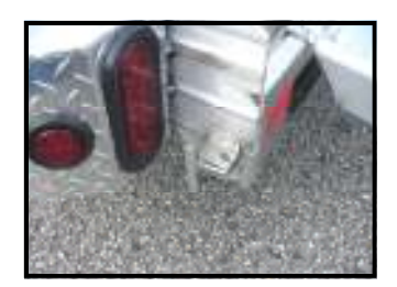
Ramp storage single point master lock