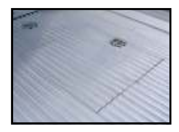
Optional recessed tire storage box