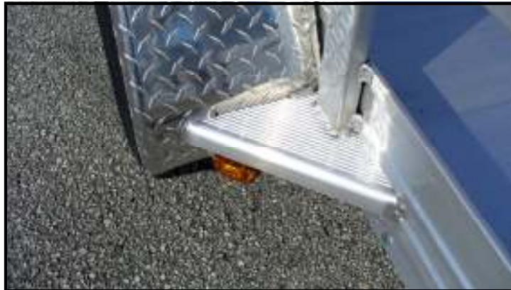
Extruded non skid running board front