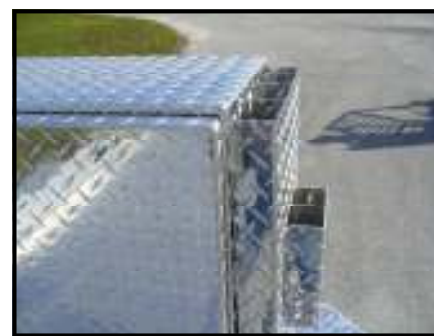
Mower and edger rack