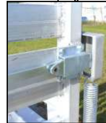
Ramp gate deadbolt & lever lock