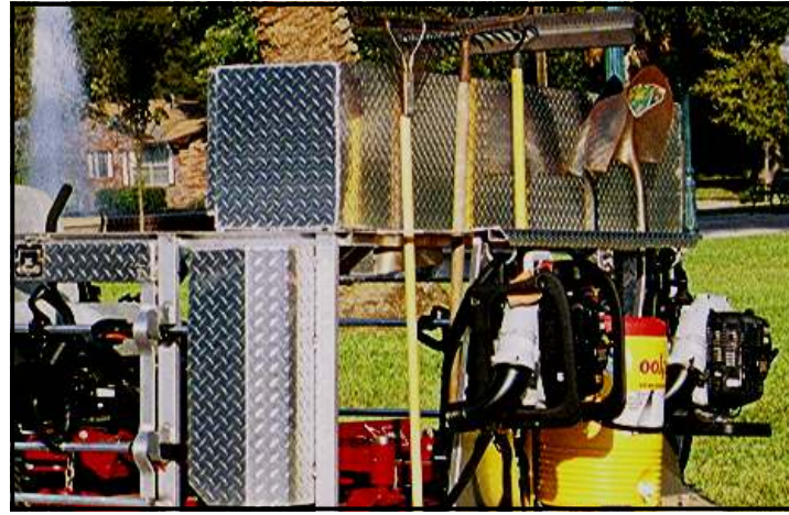
Locking tool rack on front of rack for 2 back pack