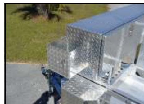
Trimmer string box