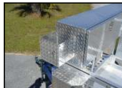
Trimmer string box