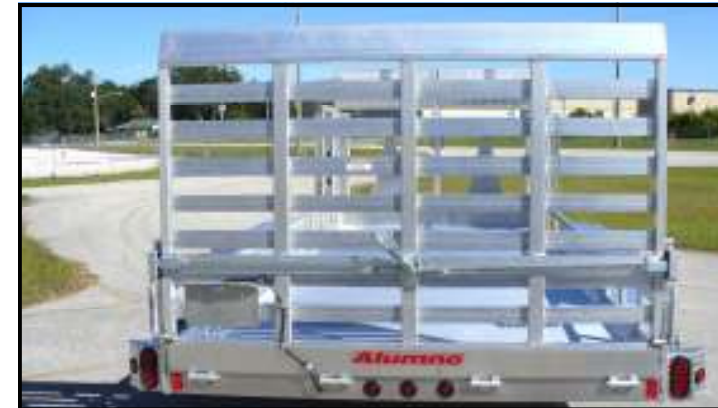
Full width ramp gate with single lever lock

Alumne is a leader for Aluminum Trailers in the green industry. Our trailers are made from high-quality, corrosion-resistant Aluminum Extrusion specifically designed to be lighter, stronger, and more durable. With fuel cost going higher every day the Alumne Lawn Maintenance Trailer is the ultimate solution for lawn maintenance contractors. It has an all aluminum frame structure, increasing pay load, eliminating preventive maintenance and maintaining its value. The entire trailer can be cleaned with pressure washing. All lighting is LED and the electrical system is sealed. By combining these innovative techniques along with proprietary Alumne extrusions, Alumne has created the best trailers in the industry.