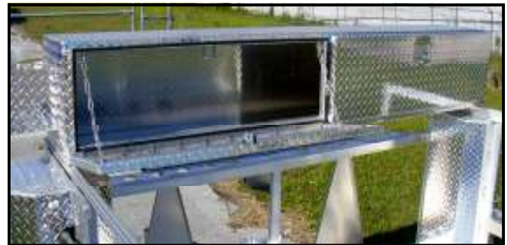
Top mount tool box