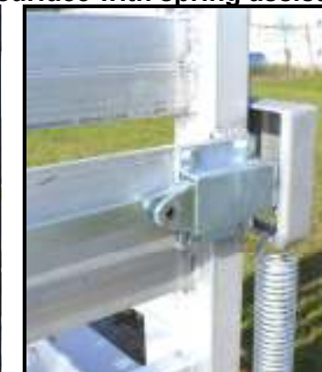
Ramp gate deadbolt & lever lock