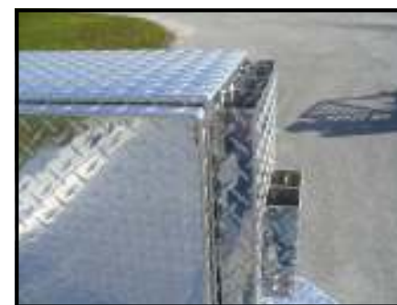
Mower and edger rack