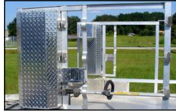
Locking side trimmer racks