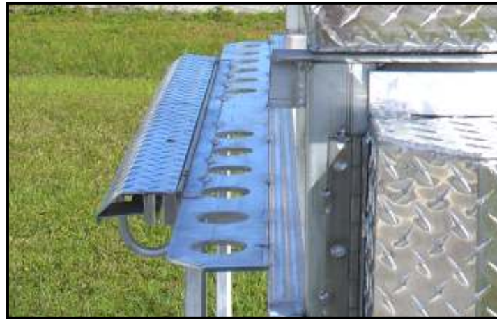
Shovel & rack rack