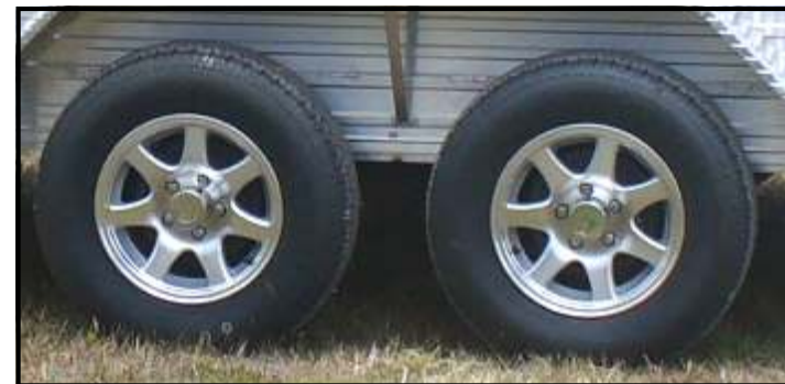
Optional aluminum spoke wheels