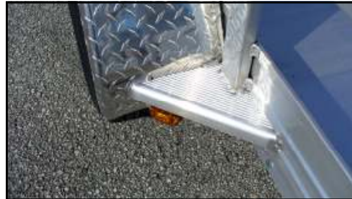
Extruded non skid running board front