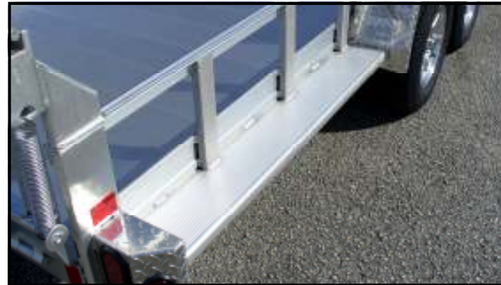
Extruded non skid running board rear