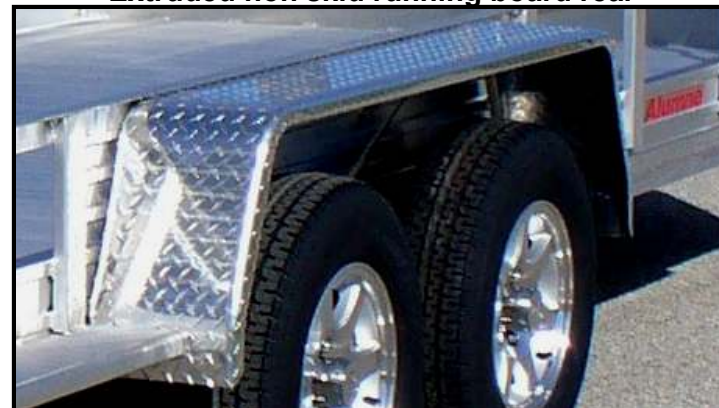
Tread plate heavy gage fenders

Alumne is a leader for Aluminum Trailers in the green industry. Our trailers are made from high-quality, corrosion-resistant Aluminum Extrusion specifically designed to be lighter, stronger, and more durable. With fuel cost going higher every day the Alumne Lawn Maintenance Trailer is the ultimate solution for lawn maintenance contractors. It has an all aluminum frame structure, increasing pay load, eliminating preventive maintenance and maintaining its value. The entire trailer can be cleaned with pressure washing. All lighting is LED and the electrical system is sealed. By combining these innovative techniques along with proprietary Alumne extrusions, Alumne has created the best trailers in the industry.