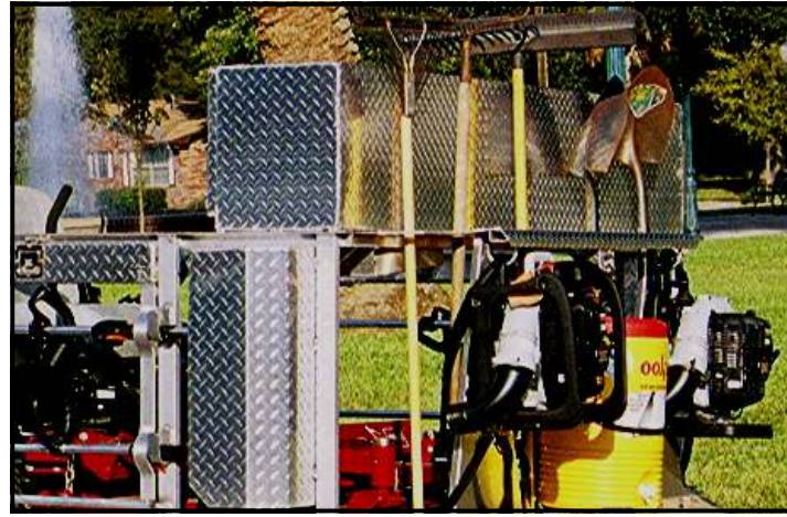
Locking tool rack on front of rack for 2 back pack