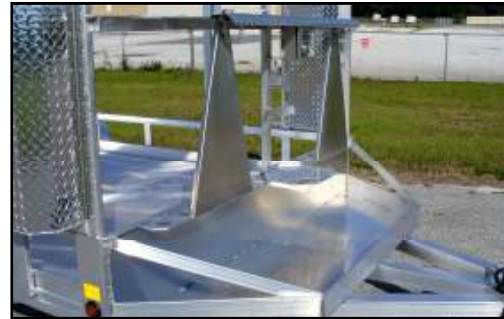
Open storage box water cooler & back pack rack