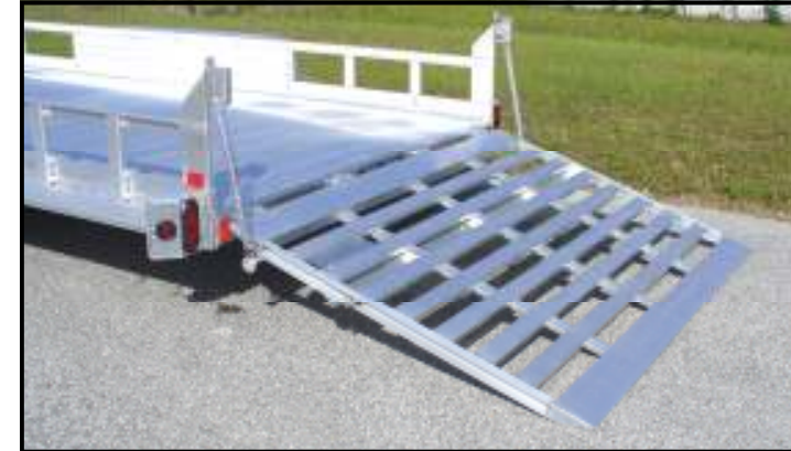
Extruded non slip gate surface with spring assist