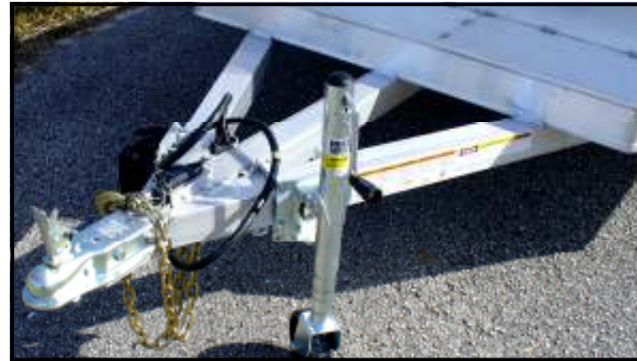
Triple tube tubular tongue frame