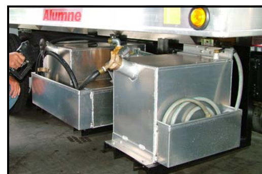
Fuel station for regular and mixed fuel