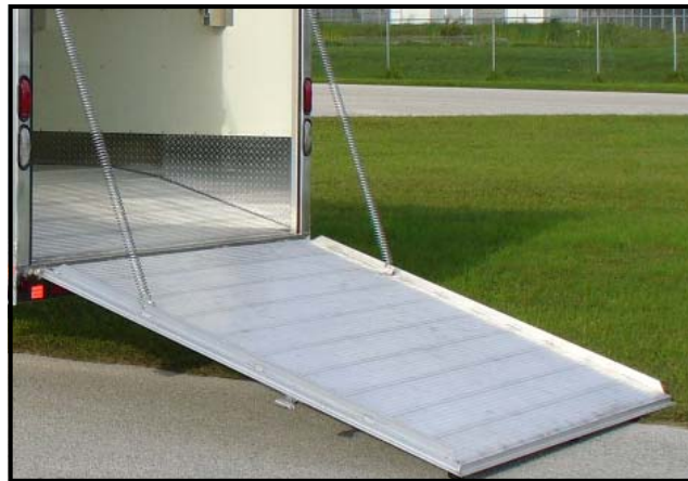
Extruded Aluminum Ramp Deck with spring assist lift