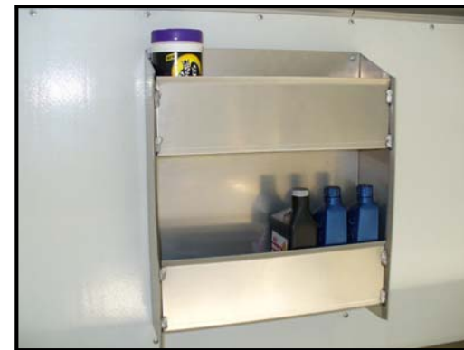
Quart bottle rack