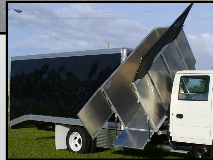
Mini side dump for trash removal 3 Yd Capacity