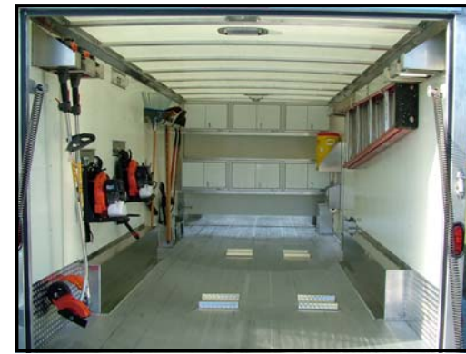
Cabinet & racks