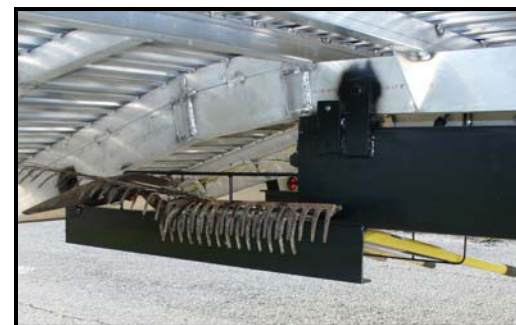
Tool rack under beavertail