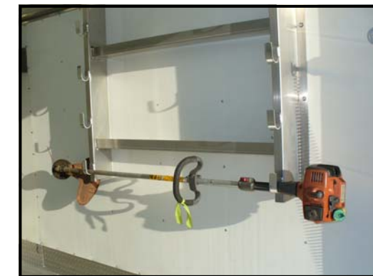
Horizontal trimmer rack