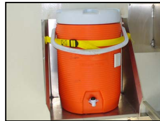
Wall mounted water cooler rack