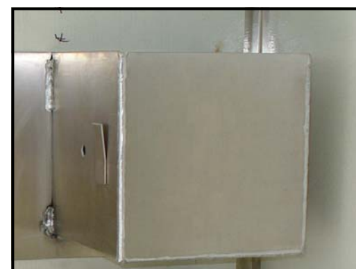
Trimmer string rack