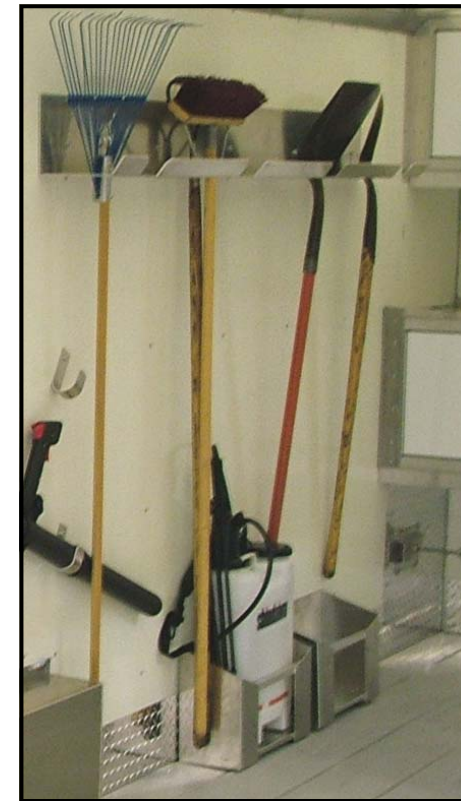
Wall mounted shovel broom & rack