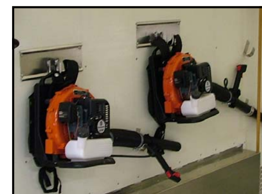
Back pack blower rack