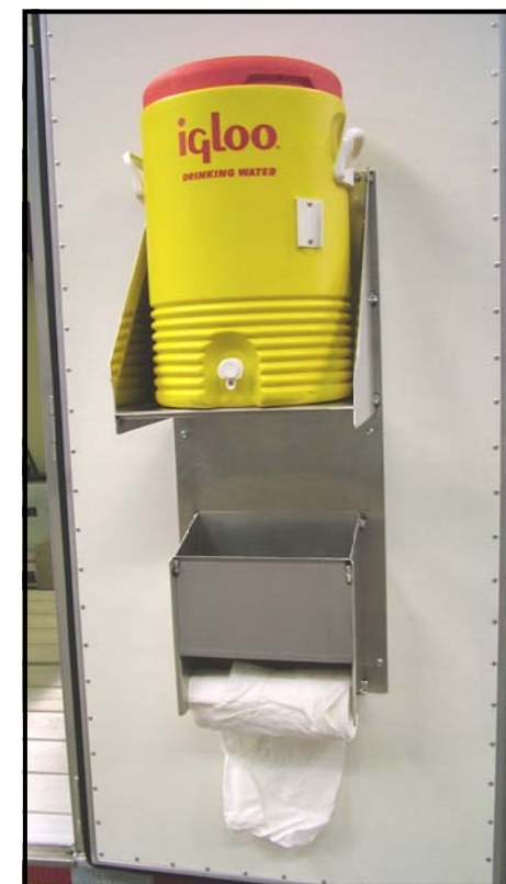
Door mounted water cooler & hand cleaning station rack