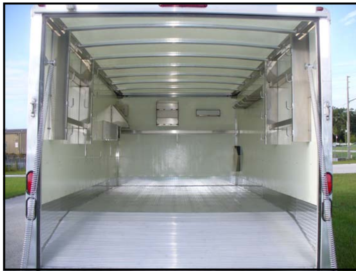
Translucent Roof composite wall lining Extruded Aluminum floor and ATP wall guard standard