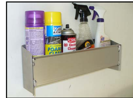
Pistol grip bottle rack