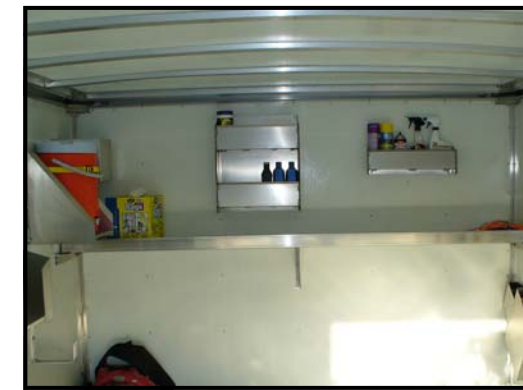
Front work bench