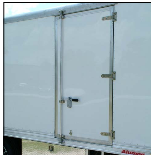
SIDE DOOR WITH SECURE CAM LOCK SYSTEM