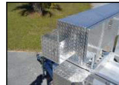
Trimmer string box