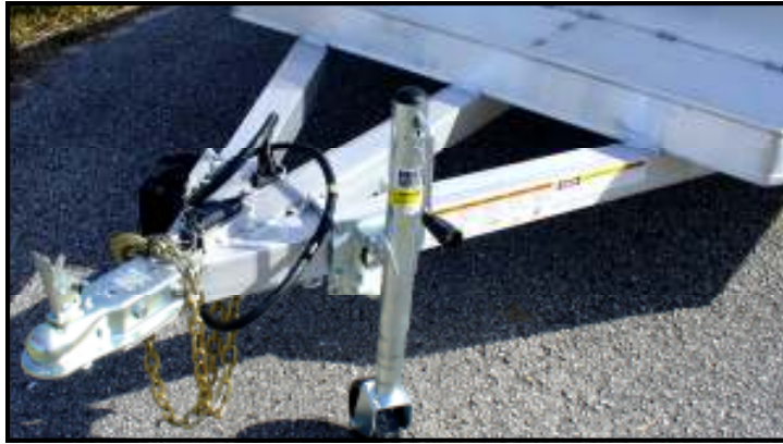
Triple tube tubular tongue frame

Alumne Manufacturing is a leader for Aluminum Trailers in the green industry. Our trailers are made from high-quality, corrosion-resistant Aluminum Extrusion specifically designed to be lighter, stronger, and more durable. With fuel cost going higher every day the Alumne Lawn Maintenance Trailer is the ultimate solution for lawn maintenance contractors. It has an all aluminum frame structure, increasing pay load, eliminating preventive maintenance and maintaining its value. The entire trailer can be cleaned with pressure washing. All lighting is LED and the electrical system is sealed. By combining these innovative techniques along with proprietary Alumne extrusions, Alumne Manufacturing has created the best trailers in the industry.