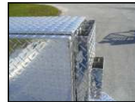
Mower and edger rack