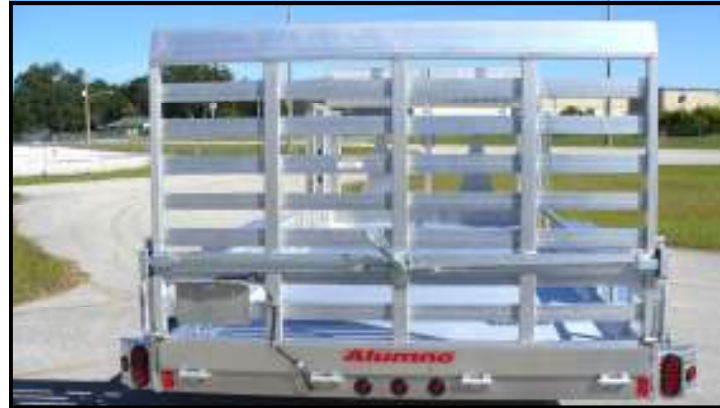
Full width ramp gate with single lever lock