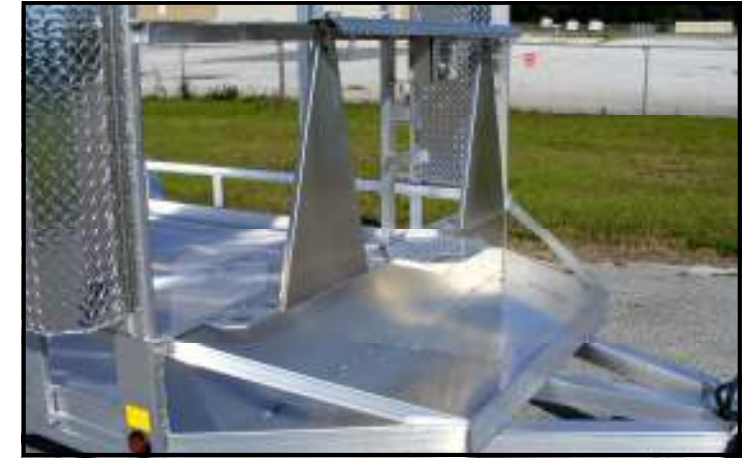
Open storage box water cooler & back pack rack