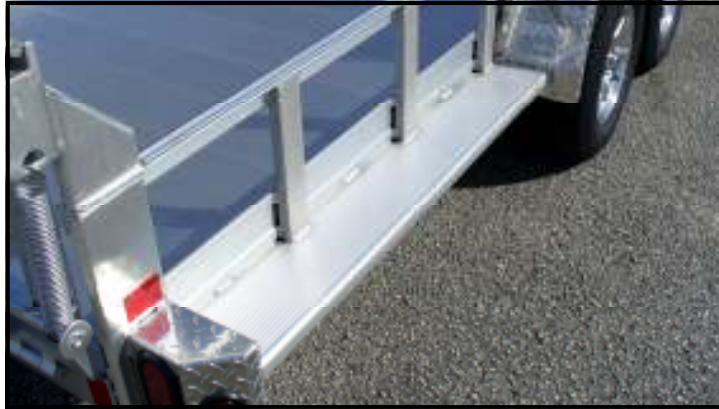
Extruded non skid running board rear