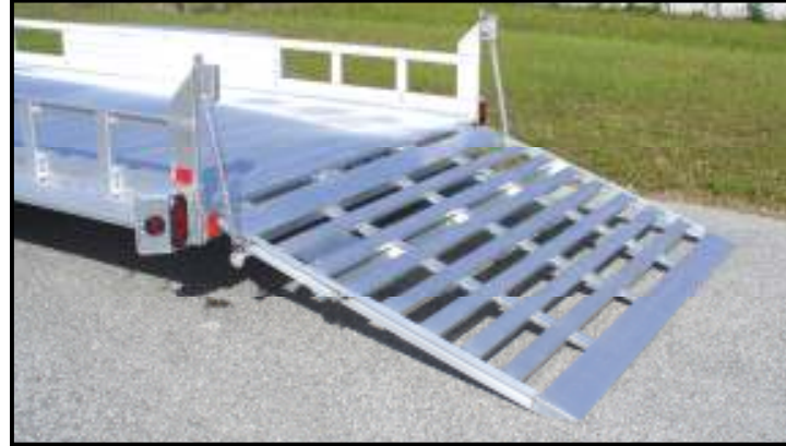
Extruded non slip gate surface with spring assist