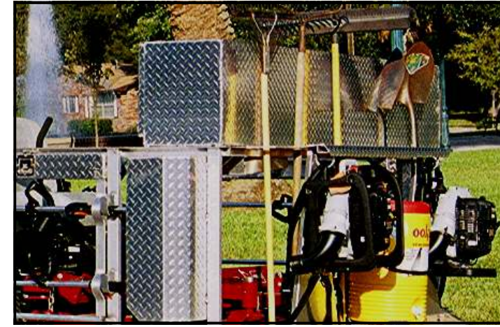
Locking tool rack on front of rack for 2 back pack