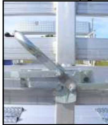
Ramp gate deadbolt & lever lock