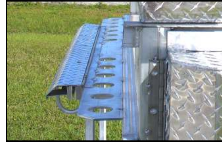
Shovel & rack rack