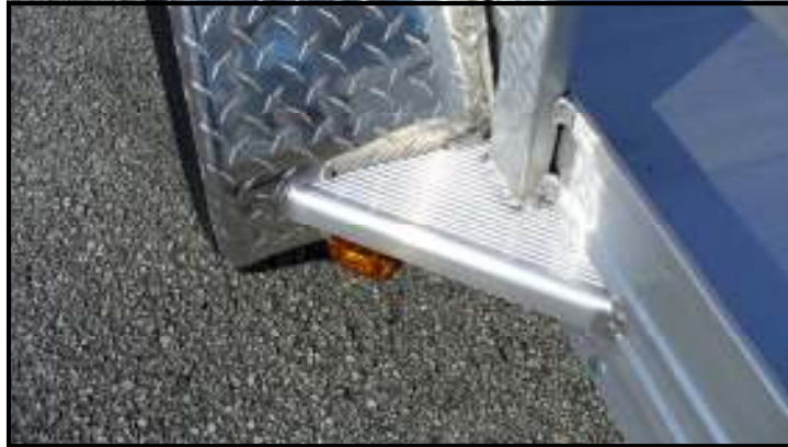
Extruded non skid running board front