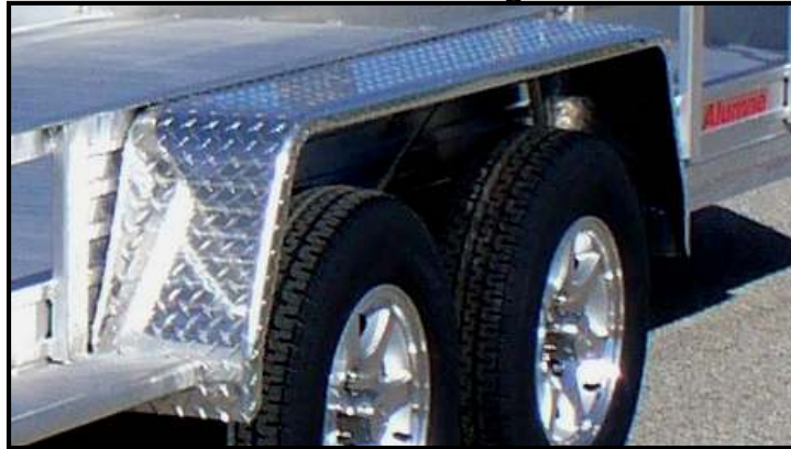
Tread plate heavy gage fenders